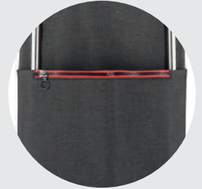
Bolsillo trasero Back pocket