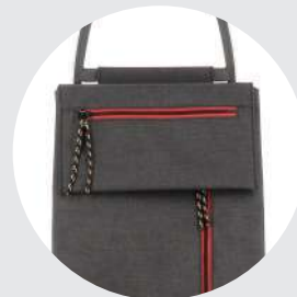
Bolsillo solapa Flap Pocket