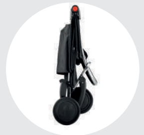
Plegado compacto Compact folding