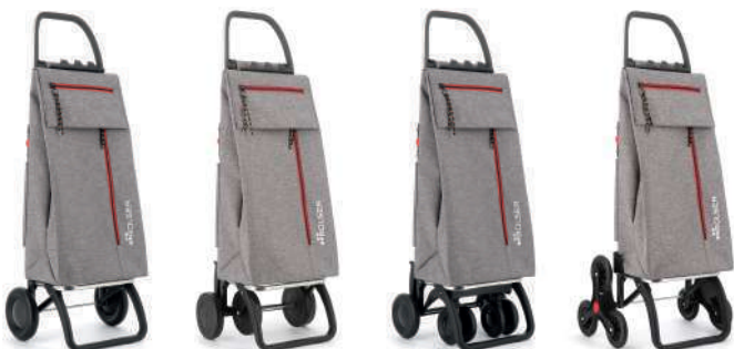
WAL004 TWEED 2L