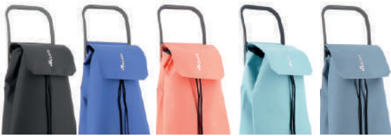
Negro Azul Coral Celeste Mar