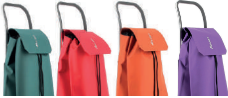
Verde Rojo Mandarina Malva