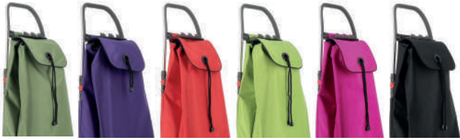
Kaki More Rojo Lima Fucsia Negro