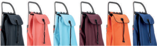
Marengo Coral Celeste Burdeos Naranja Klein