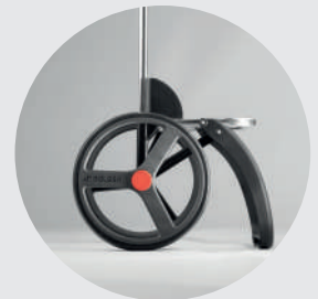
Ruedas extraíbles Removable wheels