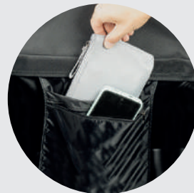
Doble bolsillo interior Two inside pockets