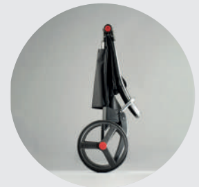
Plegado compacto Compact folding