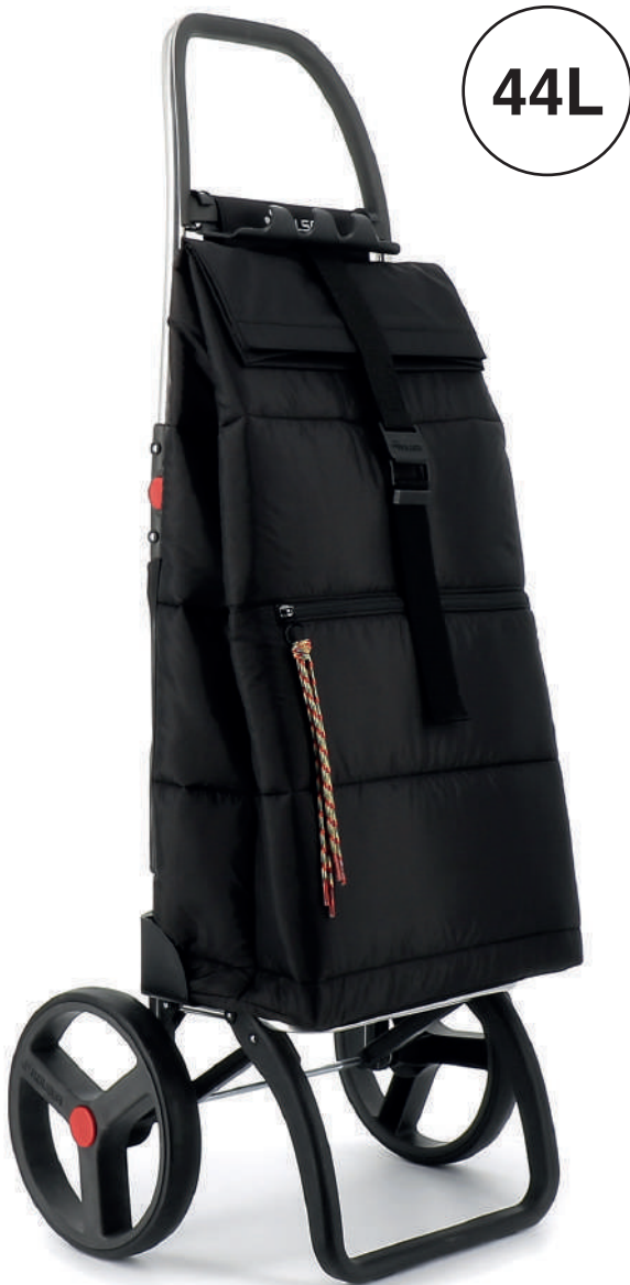
BIG008 POLAR 2LRSG